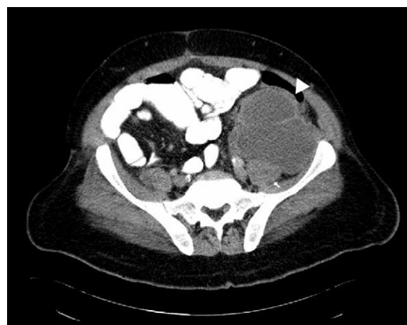
Figure 2 Pancreatic pseudocyst (white arrow) dissecting through the left psoas muscle pathway. Small arrow indicated the left psoas muscle.

days after the surgery, the patient presented with tachycardia, fevers, worsening abdominal pain and increased output from surgical drains. Cultures confirmed peritonitis with Pseudomonas aeruginosa and methicillin resistant Staphylococcus aureus . The patient required a total of five laparotomies for debridement and retroperitoneal washout, as well as prolonged antibiotic therapy. Late complications included wound infection and incisional hernia that were later repaired. Follow up CT of the abdomen revealed a 5 cm cystic lesion in the tail of the pancreas with no evidence of pelvic collections. At that time there was no further complains of dyspareunia.