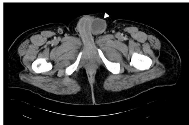
Figure 3 Pancreatic pseudocyst that dissected through the inguinal canal towards the scrotum (white arrow), and compressing the base of the penis.

Pancreatic pseudocyst is a common complication of acute and chronic pancreatitis. It is defined as a pancreatic fluid collection in the abdominal cavity surrounded by a fibrous non-epithelized capsule. This is an important feature in differentiating pseudocysts from cysts or cystic neoplasms of the pancreas. A significant number of pancreatic pseudocysts are asymptomatic and are located at the peritoneal