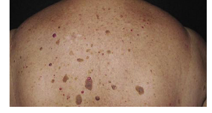
Figure 2 Dermal lesions on the back (seborrheic keratoses).