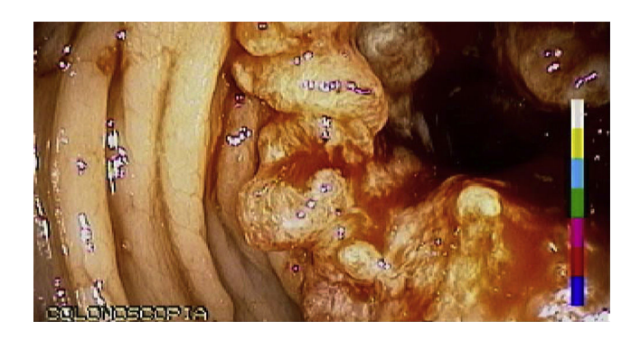
Figure 1 Colonoscopy showing a friable lesion with irregular edges, 13 cm from the anal margin, with a histopathologic diagnosis of adenocarcinoma.

The sign of Leser-Trélat is defined as the abrupt appearance and rapid increase in size or number of multiple seborrheic keratoses associated with a cancer. The sudden presentation of a large number of pigmented seborrheic keratoses should alert the clinician to rule out other entities and associations with neoplasia. Diagnosis of the skin lesions is confirmed through biopsy.