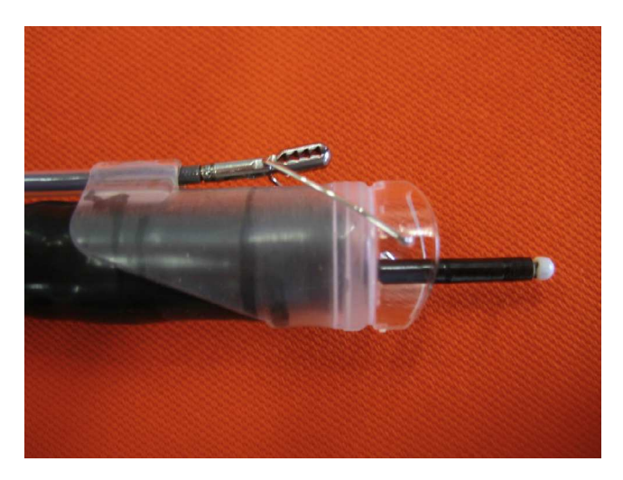
Figure 1 Closed EndoLifter.