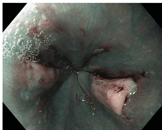
Figure 2 Mirror-image ulcers in the distal third of the esophagus seen through narrow band imaging (NBI), highlighting the vascular patterns and areas of bleeding.