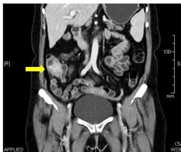
Figure 1 Abdominal tomography scan using contrast medium showing a tumor, 5 cm in diameter, at the level of the cecum, with thickening of the wall in the terminal ileum and the cecum; adenopathies are also identified.

lumen, along with a poorly delineated abscess-like lesion in the cecum. A pericecal abscess with extensive Actinomyces spp. colonization, «sulfur granules», and acute and chronic inflammation were viewed during the histopathologic study (fig. 2). Given these findings, 4-month therapy with amoxicillin plus clavulanic acid was begun. Postoperative progression was satisfactory and the patient was released 4 days after the surgery. Actinomycosis is a chronic suppurative disease that presents with the formation of fistula, sinus, inflammatory pseudotumor, or abscess. These are the characteristics that make it necessary to consider inflammatory bowel disease, inflammatory pelvic disease, and tuberculosis in the differential diagnosis. The infection can simulate malignancy due to its capacity to invade adjacent tissue and form masses. 4–6 Up to 80% of the cases occur in women and 60% are associated with the