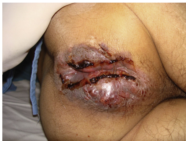
Figure 1 Anal tumor upon admission to the emergency department.

A 40-year-old man with no pathologic medical history was diagnosed with grade III hemorrhoidal disease through anoscopy. A proximal organic problem was ruled out after flexible rectosigmoidoscopy that extended up to 55 cm from the anal margin. A Ferguson hemorrhoidectomy of the 3 main bundles was performed. He was released from the hospital 24 hours after the surgery and finished his outpatient consultation at 30 days with closed wounds and no signs of infection. The histopathologic study reported hemorrhoidal bundles with ingurgitation. He returned 45 days after his release from the outpatient service complaining of anal pain, the sensation of a mass, bleeding, and diarrhea. Physical examination revealed a circumferential, indurated, 8 × 8 cm tumor in the perianal region with a hyperemic and bluish-purple appearance (fig. 1). It was limited to the anal duct and did not involve the rectum. The ELISA test for HIV was carried out and confirmed by a positive Western-Blot test; this test had not been done prior to the surgery. A biopsy was taken and the histopathologic study