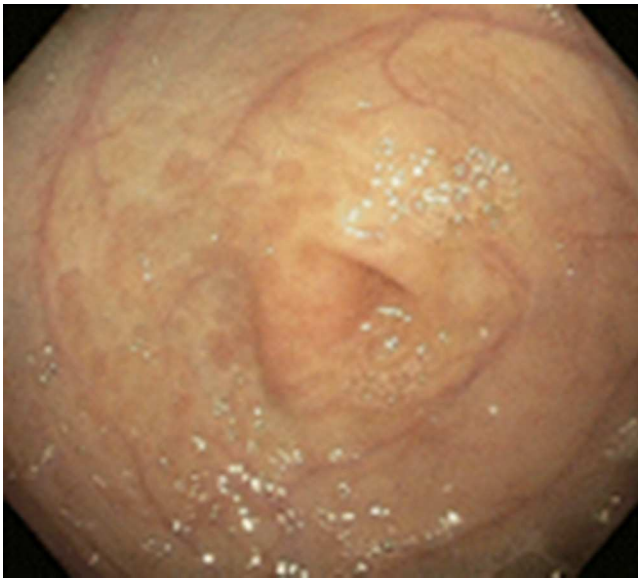
Figure 1 Endoscopic image of a patient with CMPA that shows erythema of the mucosa at the level of the antrum.