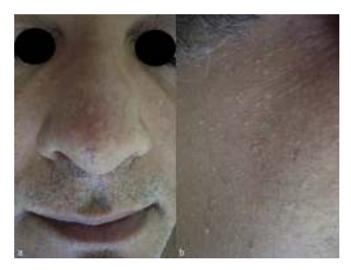
Figure 1 Clinical image showing multiple, smooth, firm, cupuliform normal skin-colored papules on the nasal dorsum (a) and on the right cheek (b), indicative of fibrofolliculomas.

The Birt-Hogg-Dubé syndrome (BHD) is an inherited autosomal dominant genodermatosis caused by mutations of the folliculin (FLCN) gene. Patients present with fibrofolliculomas (5 are pathognomonic), pulmonary cysts, and renal cancer. The relation of BHD to polyps and colorectal cancer was initially described, but this association is not currently recognized. Nevertheless, FLCN gene mutations have recently been implicated in the development of colon cancer, questioning this viewpoint. We present herein the case of a 55-year-old man that was asymptomatic and evaluated for multiple facial lesions histologically compatible with fibrofolliculomas located predominantly on the nose and cheek (Fig. 1). After BHD diagnosis, an MRI of the kidney and a chest x-ray were ordered and did not identify any pathologic findings. A fecal occult blood test was positive. Colonoscopy revealed a 3 cm cecal sessile polyp (Fig. 2), and biopsy reported a tubulovillous adenoma with high-grade dysplasia that was extirpated through a right