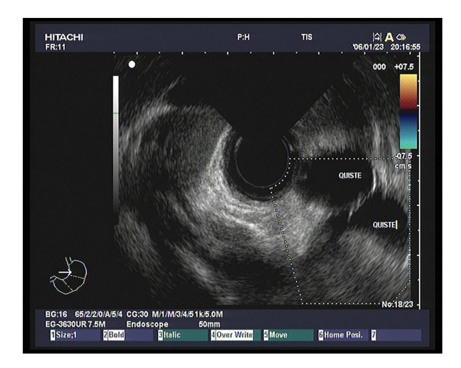
Figure 3 Endosonographic image showing multiple cystic pancreatic lesions that guided the FNA.