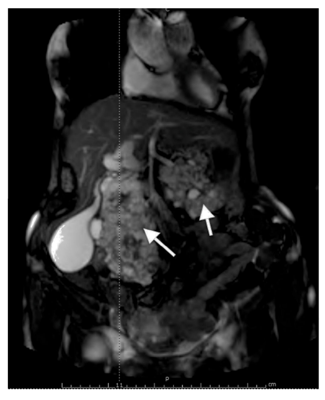
Figure 2 The same information as Figure 1.