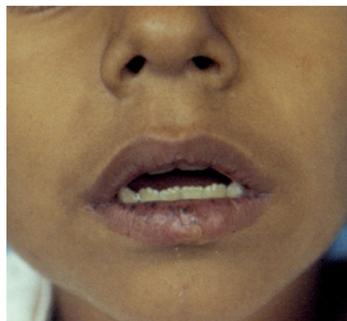
Figure 1 Hyperchromatic macules on the lips.

A 10-year-old boy had a family history that included a father and brother with Peutz-Jeghers syndrome. His current illness began at 2 years of age with the presence of blackish hyperchromatic spots of approximately 3 mm in diameter on his lip area that increased in number and diameter (Fig. 1). From the age of 6 years hyperchromatic spots with similar characteristics appeared on his palms and on the soles of his feet, where they were present on the areas of the toes, the metatarsi, and the heels (Fig. 2). Imaging and endoscopic studies confirmed the presence of polyps in the colon and small bowel (Fig. 3). The histopathology study reported that they were of the hamartomatous type (Fig. 4). Peutz-Jeghers syndrome is characterized by the presence of numerous hamartomatous polyps distributed