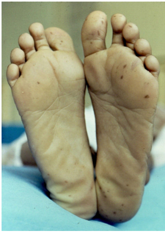
Figure 2 Disseminated plantar lentiginos associated with Peutz-Jeghers syndrome.