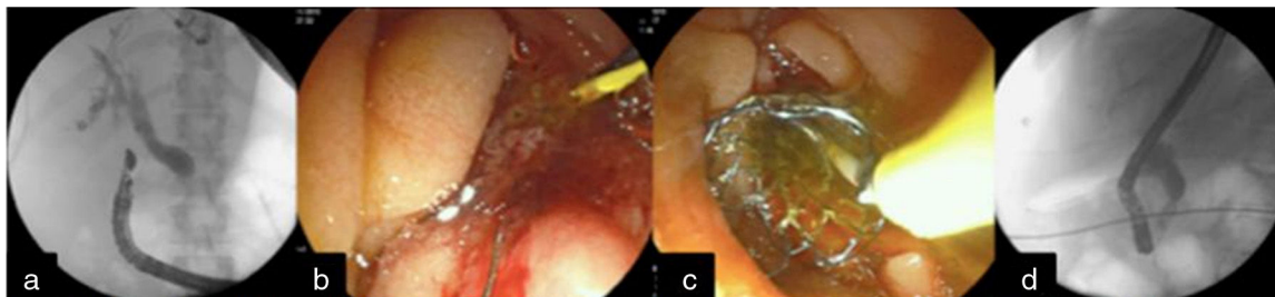
Figure 2 a) EUS-guided puncture of the common bile duct with fluoroscopic support and advancement of the guidewire into the duodenum, b). 'Rendezvous' technique and common bile duct cannulation. c) Placement of the metal biliary stent, and d) Fluoroscopic view of the self-expanding metal biliary stent.

Today, endoscopic ultrasound-guided biliary drainage is an alternative to failed ERCP drainage in patients with malignant distal biliary obstruction. It is considered a second-line technique, but the fact is that not all centers are equipped with endoscopic ultrasound and therefore continue to utilize surgical and/or radiologic drains.