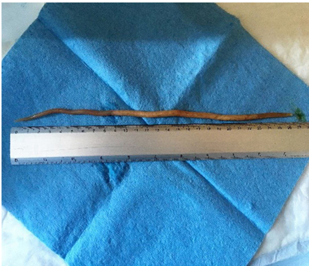
Figure 2 Ascaris lumbricoides measuring 27 cm in length.