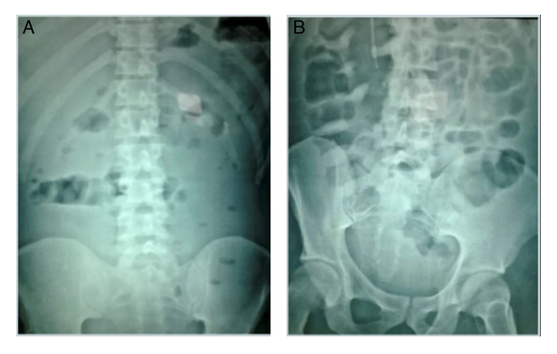
Figure 1 Radiographic progression of the patient, showing a normal radiographic pattern on the 5th day of treatment for C . difficile infection (A). However, on the 12th day of antimicrobial treatment, the patient presented with clinical worsening and important bowel segment dilation can be seen (B).