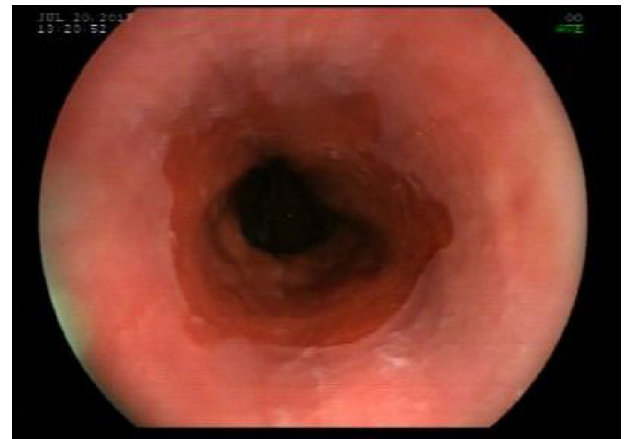
Figure 3 Control upper GI endoscopy showing esophageal mucosa with no lesions.

The authors declare that there is no conflict of interest.