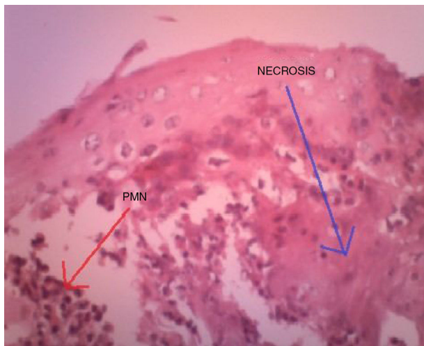
Figure 2 Permeation of polymorphonuclear neutrophils and areas of necrotized epithelium.