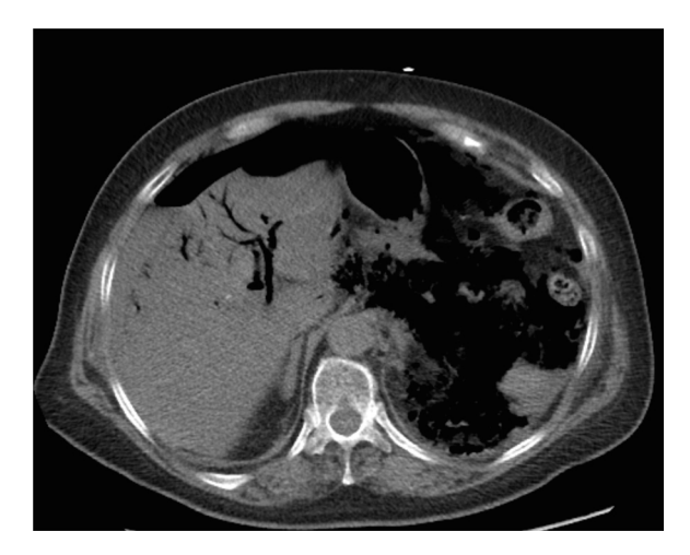
Figure 2 Axial view at the hepatic level, showing pneumobilia and the presence of a large quantity of intra-abdominal gas.