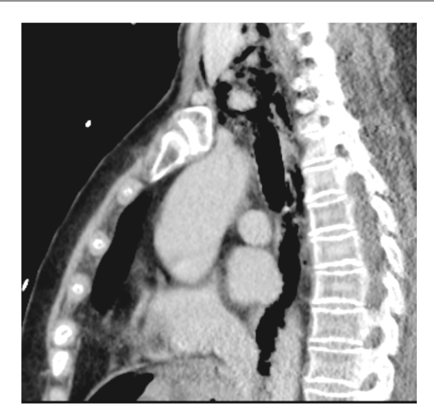
Figure 4 The process was so extensive that it caused pneumoperitoneum and spread into the periesophageal mediastinum, causing emphysema of the subcutaneous tissue of the neck.

presence of gas in and/or around the pancreatic gland due to a necrotizing infection caused by gas-producing bacteria. The patient was admitted to the intensive care unit, where she presented with multiple organ failure, and died 6 hours after having the imaging study and