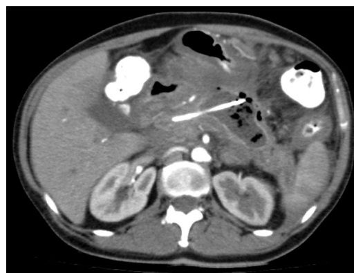
Figure 1 Abdominal tomography scan before the intervention. The walled-off necrotizing pancreatic collection is seen, with percutaneous pigtail catheter drainage. The presence of the pancreatic collection indicates the site of rupture of the main pancreatic duct.

Upon evaluation, the patient had been hospitalized for a longer period of time, with the recent in-hospital diagnosis of diabetes mellitus that required insulin therapy. Her clinical picture deteriorated, and she presented with an active systemic inflammatory response, treated with broad-spectrum antibiotic therapy indicated by the Infectious Diseases Service. The decision was made by the Interventional Radiology Service to perform percutaneous drainage of the lesions described above, providing only partial