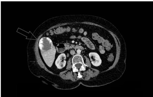
Figure 2 Axial view of the abdominal CT scan with iv contrast medium: focal lesion with peripheral nodular enhancement (approximately 5.1 \times 4.6 cm) located in liver segment V, consistent with an exophytic hemangioma.