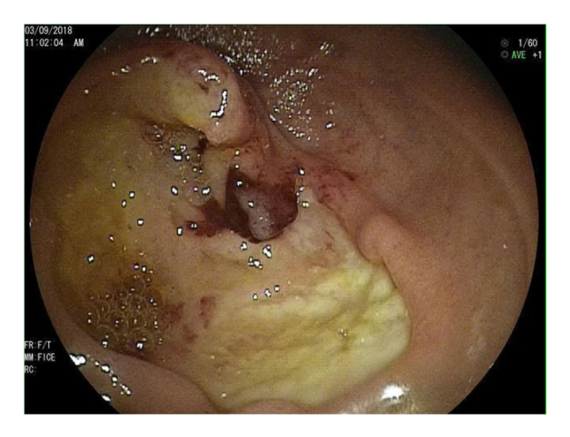
Figure 3 An almost completely ulcerated stricture in the third part of the duodenum.