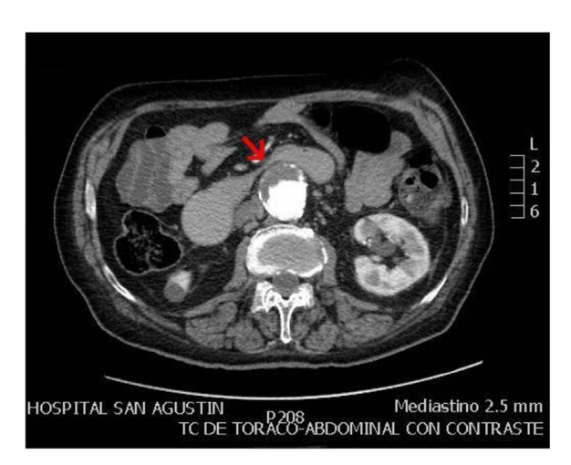
Figure 1 Thickening of the walls of the third and fourth parts of the duodenum.

E-mail address: er_vitor@hotmail.com (V. Arenas García).