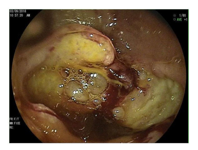
Figure 2 An almost completely ulcerated stricture in the third part of the duodenum.