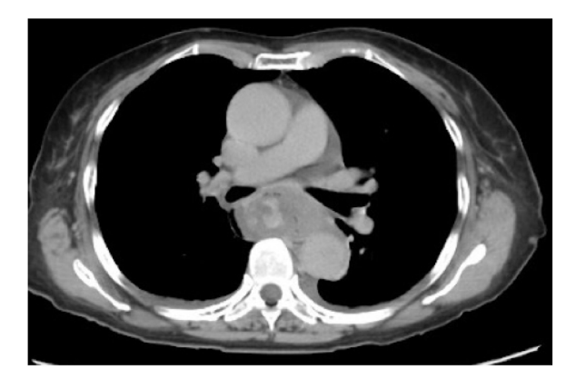
Figure 3 Chest axial tomography scan showing contrast medium extravasation in the muscle layer of the middle third of the esophagus secondary to active bleeding.

regimen of proton pump inhibitors and suspension of the acetylsalicylic acid. Chromoendoscopy 3 weeks later showed re-epithelialization of the mucosa and spontaneous resolution of the intramural hematoma (Fig. 5).