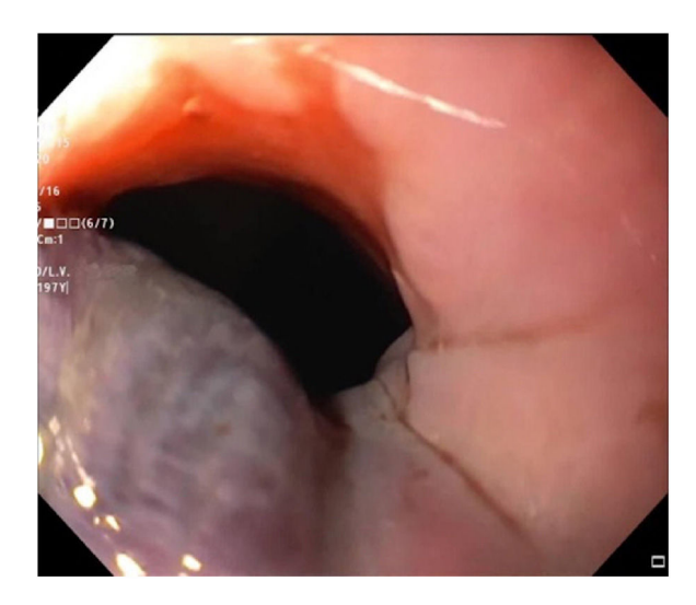
Figure 1 Upper gastrointestinal endoscopy revealing a linear violet mass partially occupying the esophageal lumen at the esophagogastric junction.

include the use of antiplatelet and anticoagulant agents, and common symptoms are chest pain, dysphagia, or hematemesis. Our patient was treated conservatively, beginning a