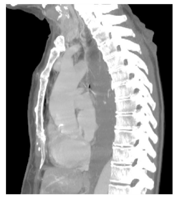
Figure 2 Chest axial tomography scan identifying the concentric thickening of the upper and middle thirds of the esophagus, associated with a dilated anomalous vessel in the muscle wall of the middle third of the esophagus in the arterial phase of the study.