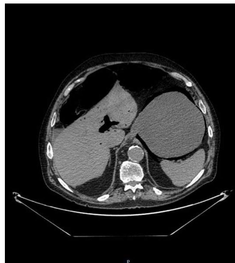
Figure 4 Axial view of the abdominal CT scan with iv contrast medium showing abundant gas in the portal vein (portal pneumatosis).

The authors declare that no experiments were conducted on animals or humans for the present research and that