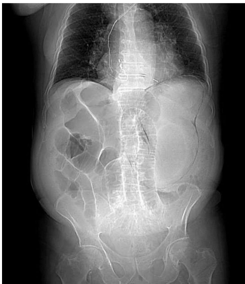
Figure 2 Luminogram from an abdominal CT scan with iv contrast medium. Intraparietal gas forming a dilated gastric silhouette is shown, as well as the bowel segment dilation.