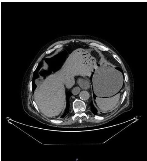
Figure 3 Axial view of the abdominal CT scan with iv contrast medium showing abundant quantities of intraparietal gas in the stomach, small bowel segment dilation with a maximum caliber of 4.3 cm, and a pneumoperitoneum of moderate quantity adjacent to the gastric body and anterior abdominal wall.

CT is the diagnostic study of choice and is essential for making early diagnosis and implementing the vital support treatment with broad-spectrum antibiotics. Surgery is only required if there is no response to conservative treatment or in cases of severe sepsis or gastric perforation. 3