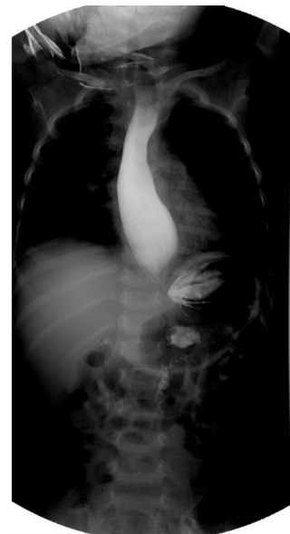
Figure 1 Esophagram showing a dilated esophagus at the level of the esophagogastric junction, with an accentuated narrowing of the distal esophageal lumen and “bird’s beak” appearance.

EA is a motility disorder with an estimated annual prevalence of 0.18/100,000 children. Symptoms are vomiting,