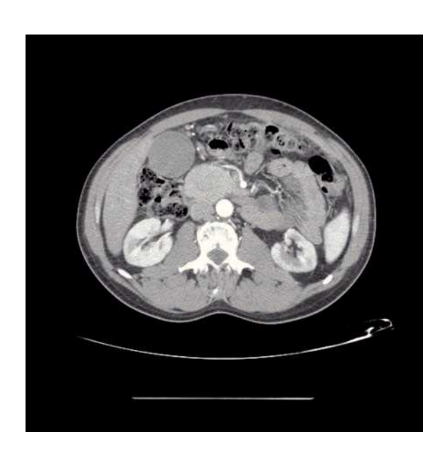
■ Figure 1. CT scan showing a large and expansive lesion in the head of the pancreas.

Chemotherapy protocol was changed to bortezomib, dexamethasone and cyclophosphamide. Four cycles of chemotherapy were administered with partial response. Patient died because infectious complications after the fourth cycle f chemotherapy.