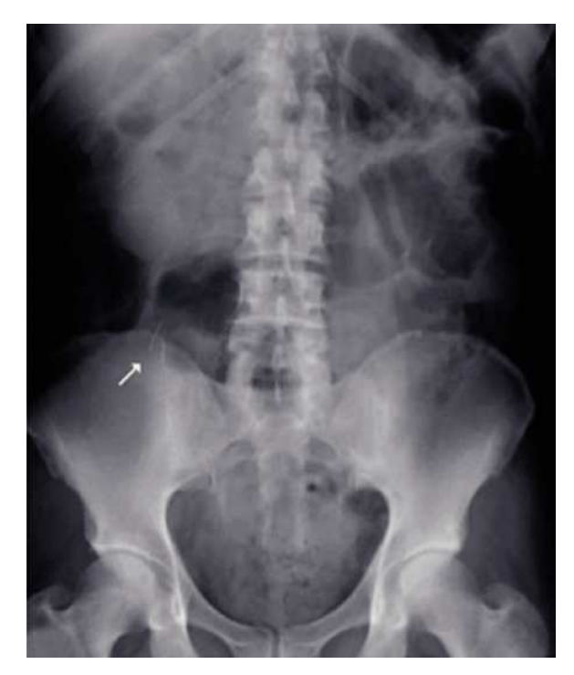
Figure 1 AP x-ray of the 66-year-old male patient showing the pins in the appendicular lumen.

A 66-year-old man with an unremarkable past medical history was admitted to the hospital with symptoms of abdominal pain of 36-hour progression suggestive of acute appendicitis. Laboratory work-up reported: 21,500 leukocytes/cc, neutrophils 84.8%, and the remaining tests were normal. A plain anteroposterior abdominal x-ray showed the presence of 2 radio-opague, filiform, sharp-ended, metallic objects measuring approximately 5 cm and located in the lower right abdominal quadrant (Fig. 1). During the medical interview, the patient denied having swallowed any type of foreign body in the previous days or months. The diagnosis of intestinal perforation secondary to foreign bodies versus appendicitis secondary to foreign bodies was established. Exploratory laparotomy revealed an approximately 9 cm retrocecal appendix perforated at its middle third section by the protruding tip of a straight pin, with its body and a second pin inside the appendicular lumen. Appendectomy was performed with no complications. The presence of the two foreign bodies inside the appendicular lumen was corroborated in the operating room through x-ray of the specimen (Fig. 2). The histologic report of the specimen was acute appendicitis with abscess and the presence of 2 straight pins in the lumen (Fig. 3). The patient progressed satisfactorily and was released 48 hours after surgery.