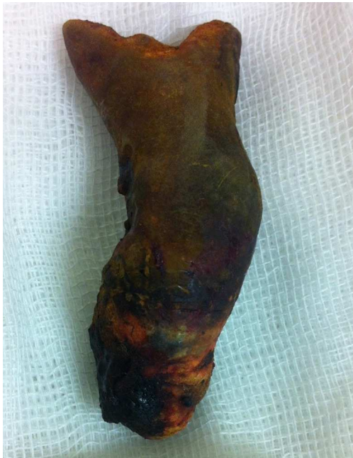
Figure 3 Staghorn calculus extracted from the bile duct.