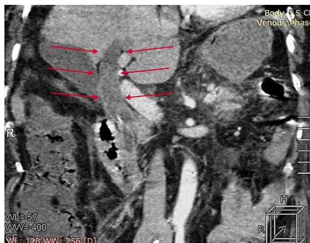
Figure 1 Abdominal CAT scan showing bile duct dilation and a calculus in its interior.

The clinical importance of biliary tract calculi is in their association with cholangitis and acute pancreatitis. Endoscopic retrograde cholangiopancreatography (ERCP) is regarded as the safest and most successful therapeutic method for extracting stones from the common bile duct. Nevertheless, large or impacted calculi that take up the entire bile duct are a therapeutic challenge. A bile duct calculus is defined as large when it is bigger than 10–15 mm. There are very few reports describing a single giant calculus (> 5 cm) in the common bile duct. We describe herein a 58-year-old woman that presented with severe acute pancreatitis. Tomography findings included a stone impacted in the bile duct, dilation of the bile ducts, and cholelithiasis (fig. 1). ERCP revealed a giant stone in the common bile duct that occupied the space up to the confluence of the hepatic ducts (fig. 2). The patient underwent a conventional cholescystectomy with bile duct exploration and a Roux-