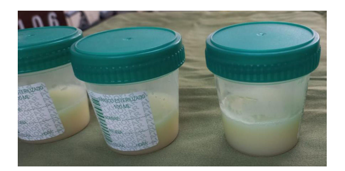
Figure 1 Milky-appearing ascitic fluid.

Inflammatory causes are reported to be associated with acute and chronic pancreatitis. Two mechanisms are reported in both: filtration through the lymph vessels damaged by pancreatic enzymes or lymph exudation due to flow obstruction secondary to inflammatory changes in the retroperitoneum adjacent to the pancreas. This