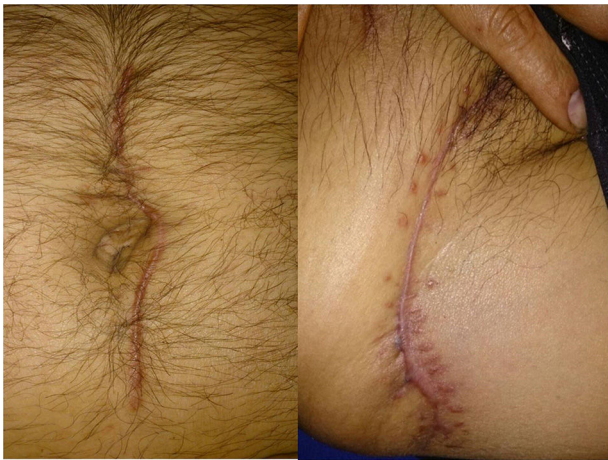
Figure 2 The final result showing the cicatrized wounds and no signs of infection.

and the abdominal drain was removed at 3 weeks, with a minimum serous output (fig. 2).