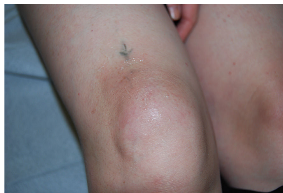
Figure 1 Hardened, erythematous zones above the right knee, with increased local temperature.