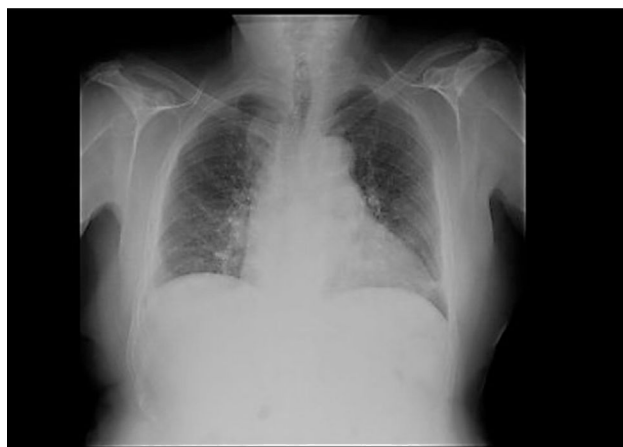
Figure 2 Posteroanterior chest x-ray with atelectasis in the lower left lobe of the lung.