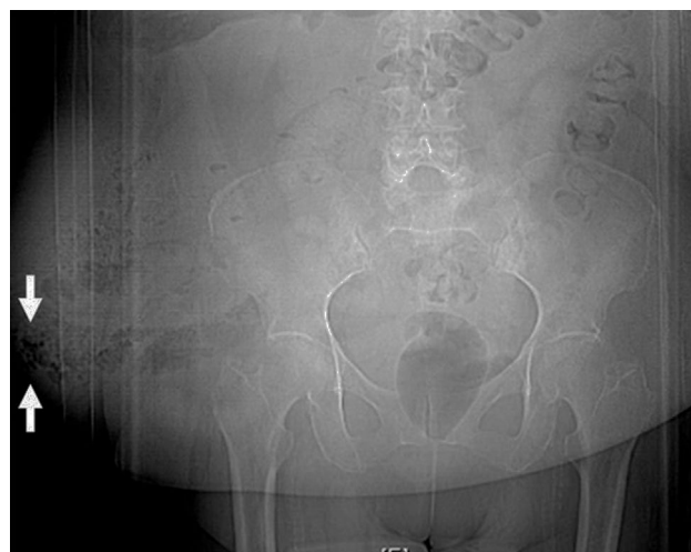
Figure 1 Topogram with the presence of gas in the soft tissues (white arrows).

Spigelian hernia is a defect in the union of the lateral edge of the rectus abdominis muscle and the medial edge of the transverse abdominal muscle. Adriaan van den Spieghel (1578-1625) described the semilunar line that now bears his name, as well as its relation to the lateral edge of the rectus abdominis muscle (Spigelian fascia). The surgeon is occasionally confronted with "unusual hernias", referred to as such for their low incidence and uncommon content. They include the Petit, Grynfeldt, Busoga, Richter, Spigelian, Romberg, Littre, Amyand, de Garengot, Bullhorn, and Handlebar hernias. Spigelian hernias represent 1 to 2% of all hernias. Their most frequent content is the small bowel and omentum. The cecal appendix inside the hernial sac has not often been described. A 63-year-old woman with a history of morbid obesity and ventral mesh repair for a Spigelian hernia that recurred 2 years prior was admitted to our service due to a complicated abdominal wall hernia. The topogram showed a ventral hernia and probable wall abscess (fig. 1). The tomography scan revealed