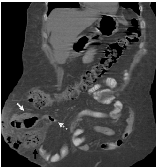
Figure 3 Coronal view of the abdominal tomography scan showing the cecum (white arrow), acute appendicitis (dotted arrow), and the abscess of the wall (black arrow) inside the hernial sac.

weeks. The patient's postoperative progression was satisfactory.