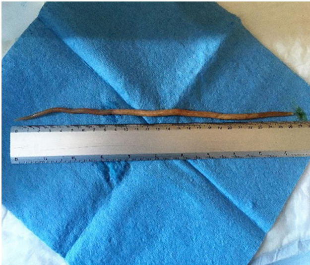
Figure 2 Ascaris lumbricoides measuring 27 cm in length.