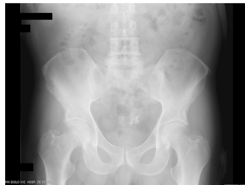
Figure 1 Unenhanced abdominal x-ray showing the dental prosthesis in the sigmoid colon.

A 75-year-old man had a past surgical history of sigmoidectomy with primary anastomosis due to complicated diverticulitis in 2007. The patient accidentally swallowed a 4-tooth dental prosthesis. Gastroscopy performed 12 h after the accident did not reveal the foreign body. During the ensuing 10-month follow-up, x-rays were taken until repeated images of the foreign body lodged in the sigmoid colon, with no progression, were observed (fig. 1). Through colonoscopy, the impacted prosthesis was identified inside a sigmoid diverticulum, proximal to the anastomosis. It was gently extracted from the diverticulum by means of a 27-mm loop polypectomy snare. Once the prosthesis was out of the diverticulum, its large size prevented it from being placed inside the overtube. Thus, it was held in place by the loop and with delicate maneuvers was extracted through the anastomosis to the rectum, without damaging the mucosa. Once in the rectum, the endoscopist eased the prosthesis out with his fingers (fig. 2). This is the first report of a case of a dental prosthesis lodged in a diverticulum of the colon.