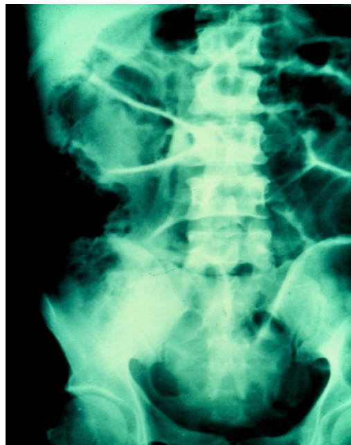
Figure 1 Radiologic image showing bowel segment distension and pneumatosis in the cecum.

A 67-year-old man had a history of type 2 diabetes mellitus. He sought medical attention for the 7-day progression of 6 to 7 diarrheic stools with mucus and blood per day, fever, nausea, and vomiting of stomach content. He presented with stabbing abdominal pain the last 3 days that began in the lower right quadrant and then became generalized. Physical examination revealed tachycardia, tachypnea, and hyperthermia of 38.7° C. He had acute abdomen with muscle resistance, a positive Blumberg's sign, and reduced peristalsis. Laboratory test results showed leukocytosis, neutrophilia, and bandemia. Plain abdominal x-rays in the standing and decubitus positions identified bowel segment distension and pneumatosis of the wall of the cecum (figs. 1 and 2). Laparotomy revealed areas of necrosis in the entire colon, with fibrinopurulent secretion and crepitation in the cecum. Subtotal colectomy was performed (fig. 3). Indirect hemagglutination and PCR testing supported the diagnosis of invasive amoebiasis. The histopathology study reported hematophagous trophozoites of Entamoeba histolytica in the wall of the colon 1,2 and lymphoplasmacytic infiltrate (fig. 4).