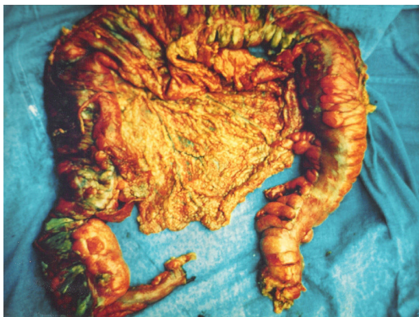
Figure 3 Surgical specimen from the subtotal colectomy.