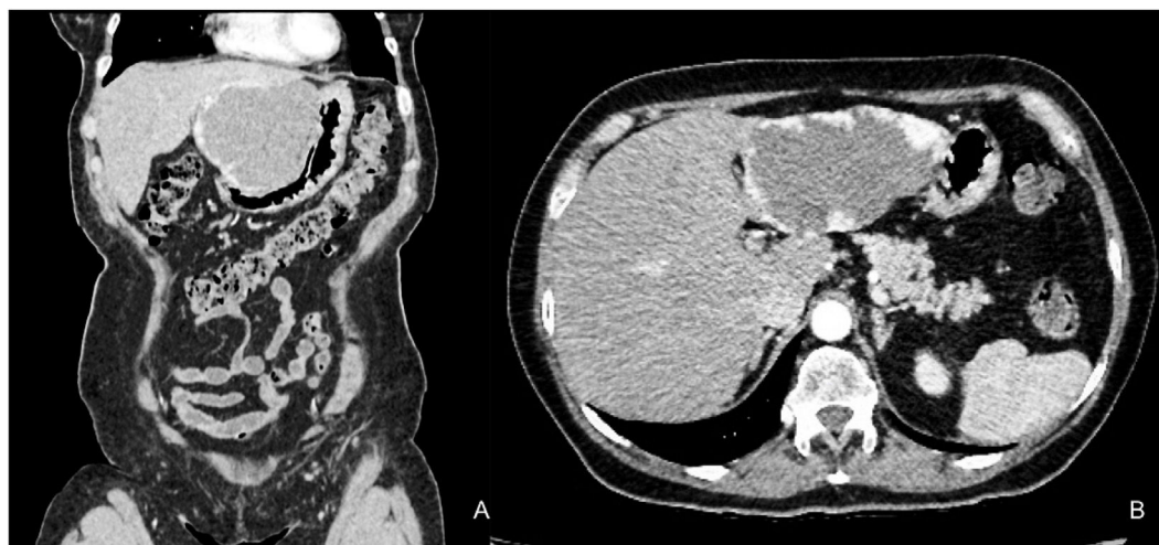
Figure 1 The arterial phase of triphasic computed axial tomography showing the hemangioma in segments II and III, measuring 95 × 98 × 90 mm. (A) Coronal view. (B) Axial view.

uptake of contrast medium, involving segments II and III, and measuring 95 × 98 × 90 mm (Fig. 1A and B).